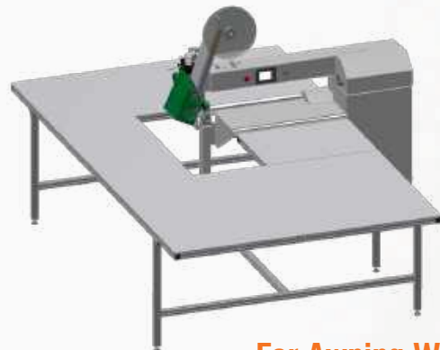
For Awning Welding