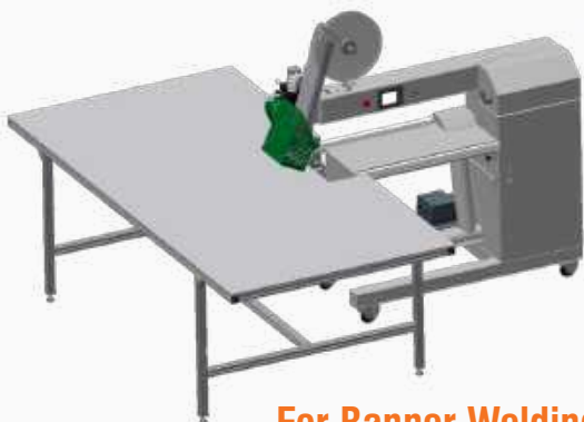
For Banner Welding